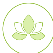
Meditation & Mindfulness